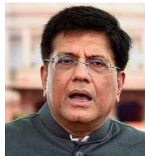
Commerce & Industry Minister Piyush Goyal

"Indian and US officials are discussing the process in which Indian companies can participate in the US government procurement market. India has to gain a TAA (Trade Agreements Act) equivalence from the US and the terms for that have to be agreed to. This important issue is likely to be on top of the agenda during the Indian Commerce & Industry Minister and USTR's meet," the source said.