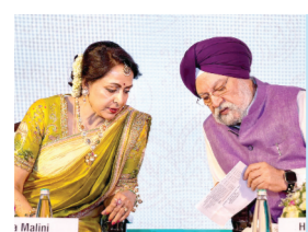
Actor and BJP MP Hema Malini with Union Minister Hardeep Singh Puri during the release of a coffee table book 'Chal Mann Vrindavan', in New Delhi