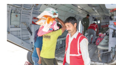
Food and medicines being supplied to a flood affected area, in Mandi, Himachal Pradesh