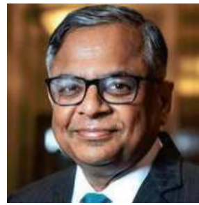
N Chandrasekaran, Chairman, Tata Sons

for AI is needed. For every positive case, there is a negative case. That is why discussion is needed."