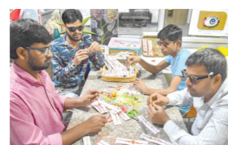
Visually impaired people make 'rakhis' at an NGO ahead of Raksha Bandhan festival, in Moradabad, UP