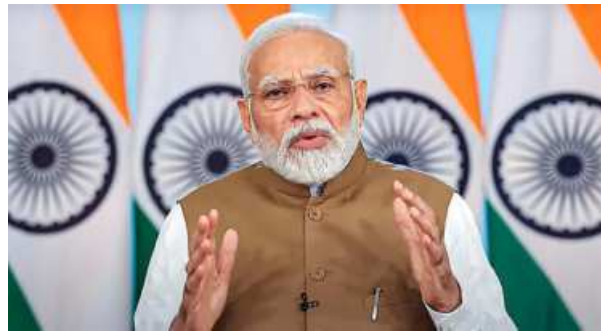
SEEKING LEVEL PLAYGROUND. PM Narendra Modi addresses the G20 Trade and Investment Ministers' Meeting in Jaipur, via a video conference

Noting that India had become the fifth largest economy in the world due to its sustained efforts, the PM said there was policy stability