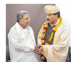
Karnataka CM Siddaramaiah felicitates ISRO Chairman Somanath after the successful soft landing of Chandrayaan-3 on the surface of the Moon, at the ISRO centre, in Bengaluru