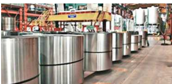
Currently, there is nil customs duty on anthracite, pulverised coal and coking coal

Tata Steel addressed the letter, written in June, to the Union Ministry of Commerce and the