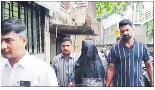
Anti-Narcotics cell personnel take one of the accused into custody

Pradesh, obtained an MSc in organic chemistry from Purvanchal University, before arriving in Mumbai in 1997. Initially, he lived at Nalasopara, working as a marketing executive in a pharma company. The police said that roughly after 15 years of dedicated work, he started selling banned drugs, though to law-breakers in the mainstream supplies world.